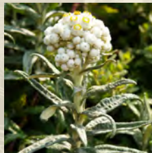
Pearly Everlasting Anaphalis margaritacea This perennial prefers dry, sunny climates. Young leaves are edible when cooked.