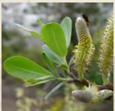
Arroyo Willow Salix lasiolepis This plant grows well in moist soils and is a good host plant for a range of butterflies.