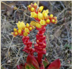
Live Forever Dudleya farinose This drought-tolerant coastal succulent grows well in sandy/rocky soils.